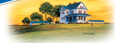
A Family Commitment to Quality Since 1920®

Good Food Company 2625 Wilson Blvd. Arlington, VA 22201 703-527-2095 gfoodc@aol.com