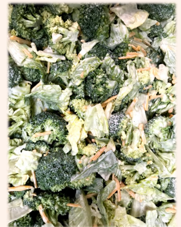
New broccoli salad with fresh broccoli, romaine lettuce, homemade ranch dressing, and a little cheddar cheese.

Never heard of picadillo? Think lentils, brown rice, onions, carrots, celery, potatoes, olives and seasoning. YUM!